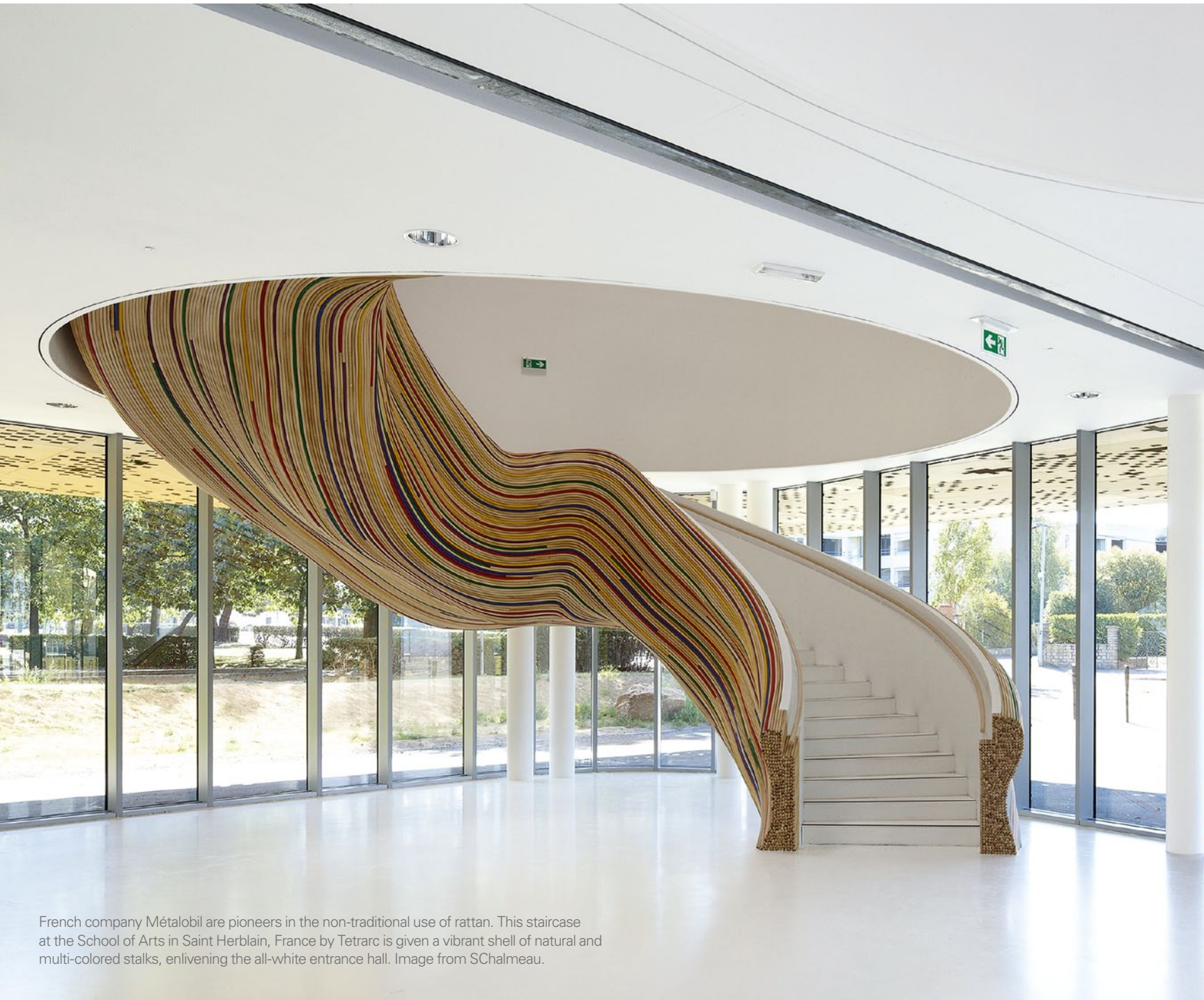
French company Métalobil are pioneers in the non-traditional use of rattan. This staircase at the School of Arts in Saint Herblain, France by Tetrarc is given a vibrant shell of natural and multi-colored stalks, enlivening the all-white entrance hall.