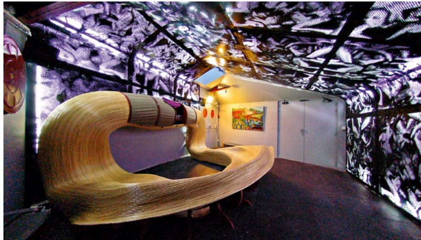
The challenge posed by creating a complex piece of furniture for Le Lieu unique music listening salon in Nantes, France, led to Métalobil's initial investigation into rattan. As the form stretches, banks, and arches, it morphs from bench to recliner to electronics compartment.

Rattan is a natural resource abundant in areas predominated by rainforests such as Africa, Asia and Australasia. It's a material about as old as humanity itself. Examples go as far back as the Ancient Egyptians who plaited its fibers into baskets as well as cushions for various seating. Throughout history, it has been used extensively worldwide yet its technology hasn't evolved much beyond the role to which tradition has relegated it. Why isn't it enjoying wider use in conjunction with current preoccupations in design?