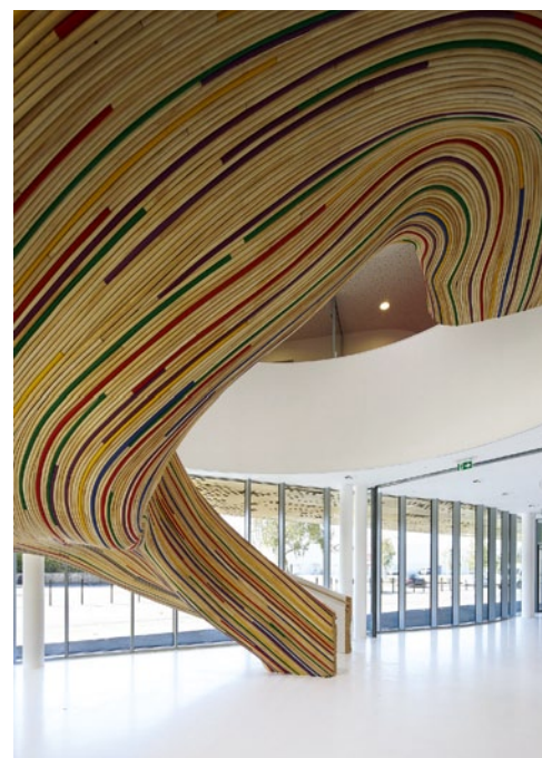
The underside of the School of Arts staircase seems to spin with imbedded streaks of color.

In 2004, a unique design for a large lounging bench for an audio video salon launched a search for specialist craftspeople who could execute the sinuous, muscular furniture. The hunt proved fruitless and Métalobil was compelled to build it themselves. After extensive research and experimentation, the idea of reinvesting in rattan was born and led to its use on the ad hoc appointment. This is furniture that imposes or recognizes no prescribed way of use and is defined depending on how the users position themselves upon it. The material and construction method allowed for the conservation of the number of rattan threads despite the piece's complex undulations.