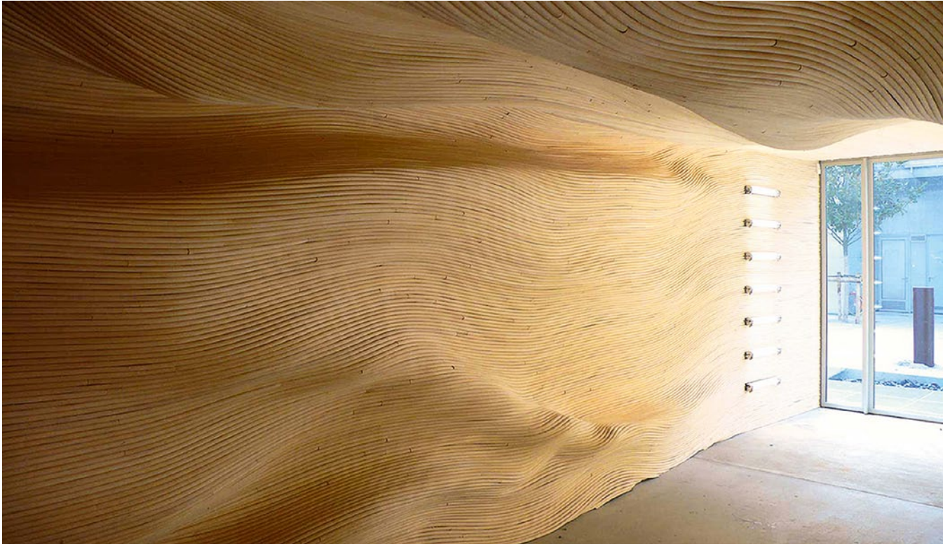
The entrance hall for the Manny Building in Nantes by French architects, Tétrarc is clad in rippling horizontal strands, encouraging both movement and touch. Below: Métalobil created numerous rattan benches for Centre Commercial Beaulieu in Nantes, one of the biggest commercial centers in France. The material allowed the design to align with the horticultural theme of architecture.